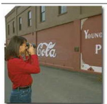
World's first outdoor Coca-Cola sign

Located on the side of Young Brothers Pharmacy