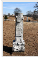
Oak Hill Cemetery (circa 1838)

http://ngeorgia.com/history/allapass.html