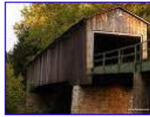
Euharlee Covered Bridge

Listed on the National Register of Historic Places