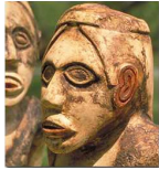
Etowah Indian Mounds

http://chieftainstrail.com/sites/etowah_indian_mounds.html