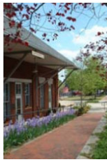
Cartersville-Bartow County Convention & Visitors Bureau Visitor Information Center http://en.wikipedia.org/wiki/Cartersville, Georgia