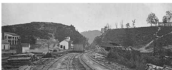
Allatoona Pass- On the Blue and Gray Trail

http://www.barnsleyresort.com/play/outpost_mock/garden.asp http://www.barnsleyresort.com/play/outpost_mock/fly_fishing.asp